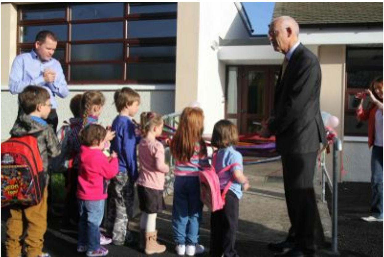
Kildare town first day