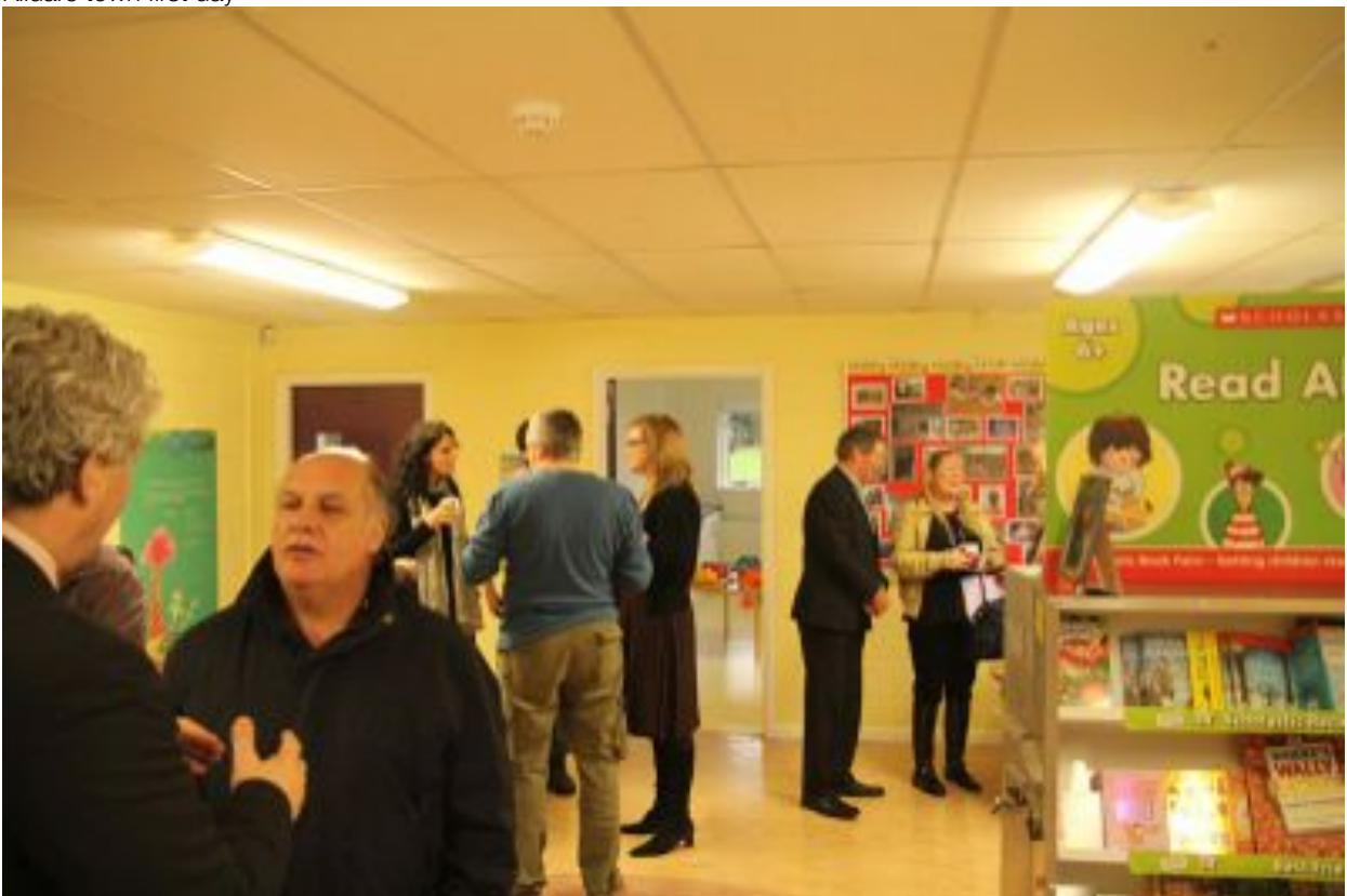
Ballinteer ETNS first term