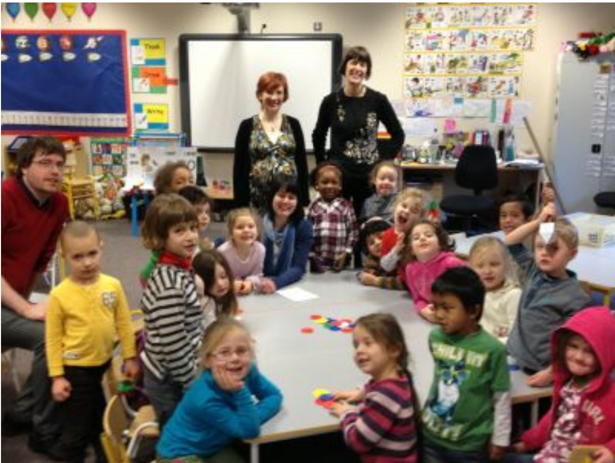
Citywest ETNS with visitors in December