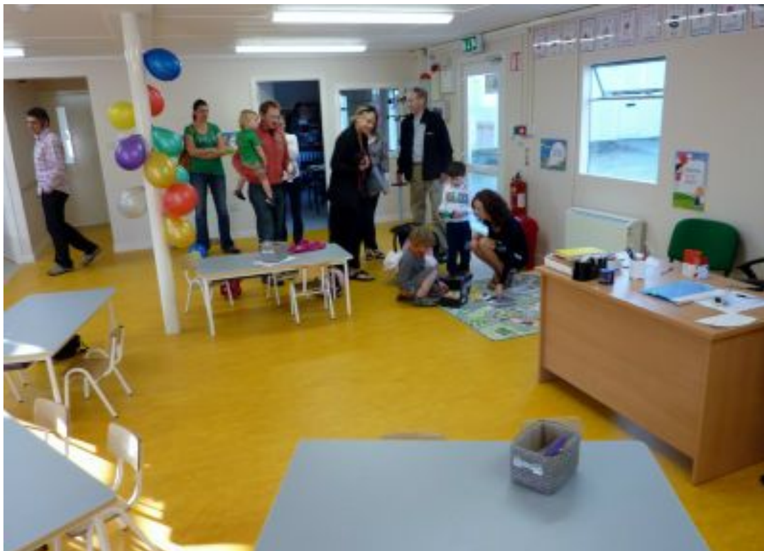
Stepaside ETNS first junior infants arrive