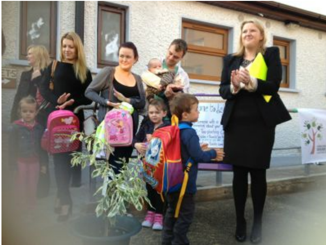
Ashbourne ETNS first day