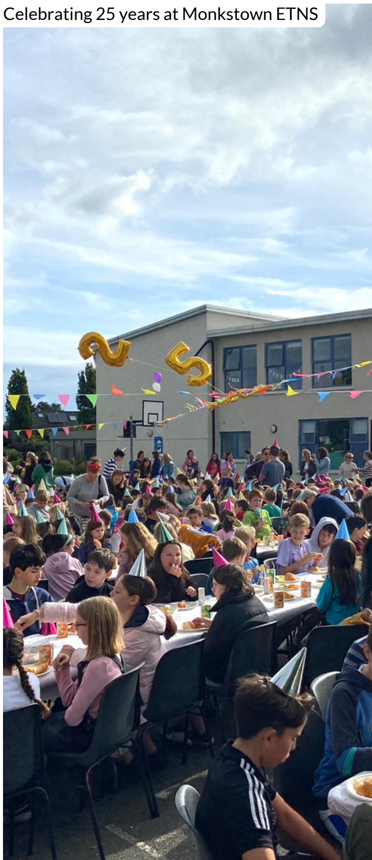
Celebrating 25 years at Monkstown ETNS