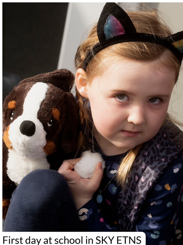
First day at school in SKY ETNS

Educate Together is grateful to Salesforce and Rethink Ireland for providing dedicated funding to support the Nurture Schools project.