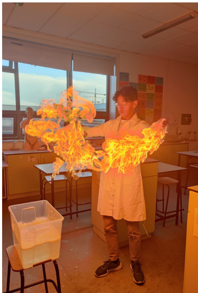
Research & development at Hansfield ETSS

Educate Together developed a new partnership with Education and Training Boards Ireland (ETBI) and all five Colleges of Education in 2022 to develop a Certificate in Ethical, Multi-Belief and Values Education. This Certificate will build on the good practice already happening in the Colleges of Education and will enhance and extend formal teacher education in the Learn Together and ETBI's Goodness Me, Goodness You curricula to every pre-service teacher in Ireland from September 2024.