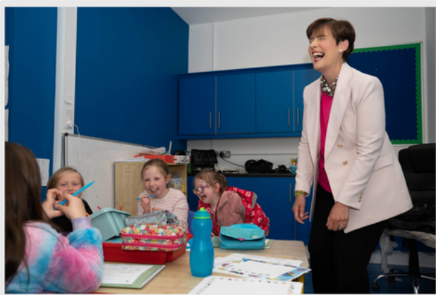
Minister for Education Norma Foley shares a light-hearted moment with pupils while visiting Castlebar Educate Together National School last Thursday.