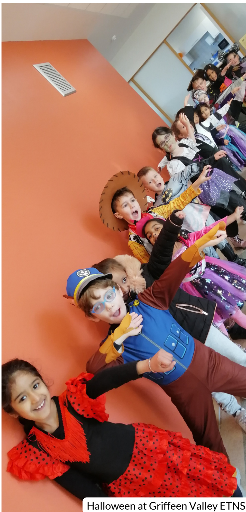
Halloween at Griffeen Valley ETNS