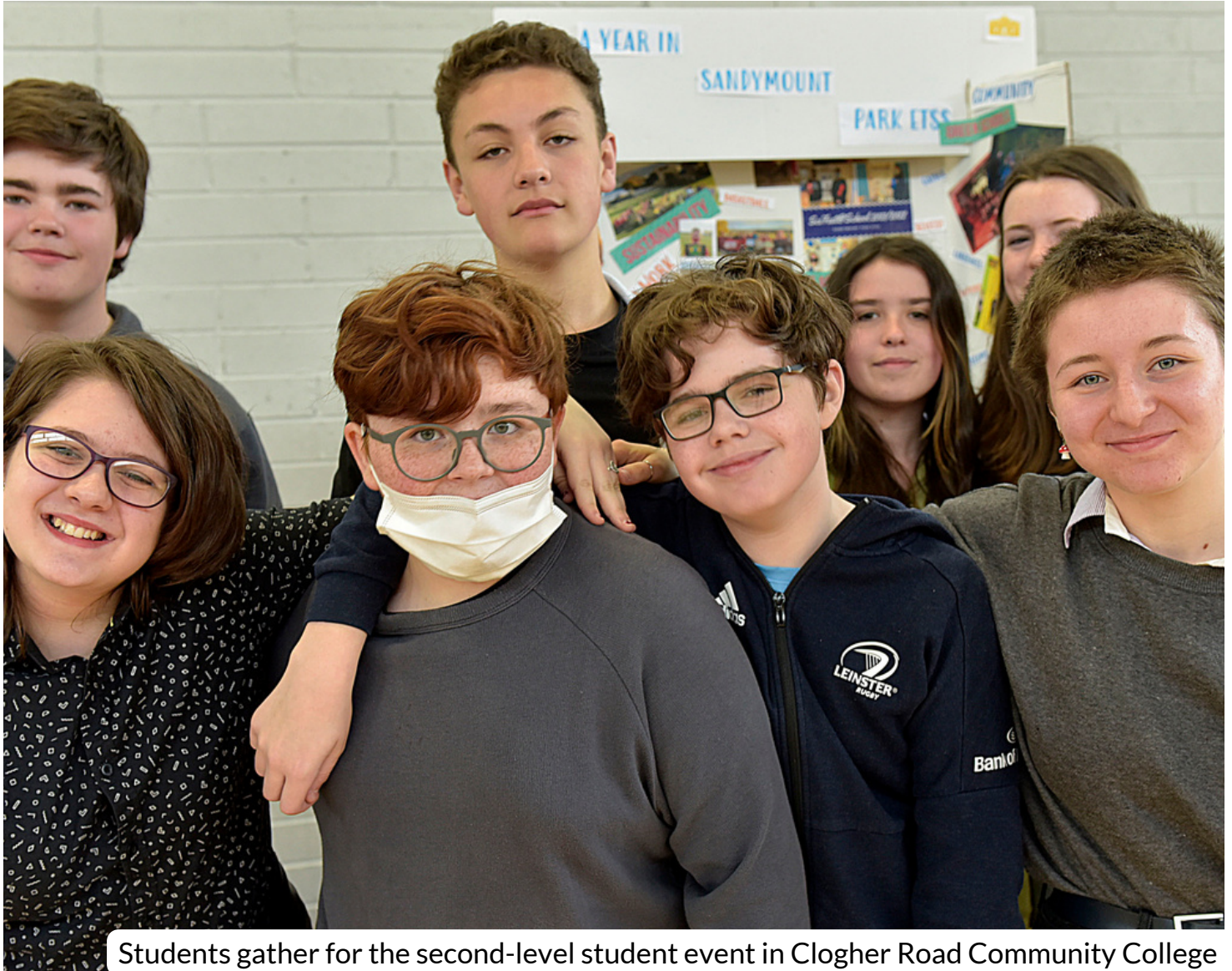
Students gather for the second-level student event in Clogher Road Community College