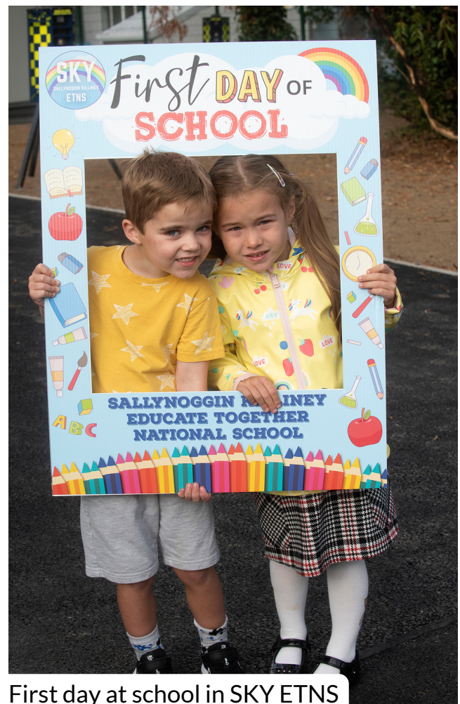
First day at school in SKY ETNS

Educate Together approved the appointment of eight principals and nine deputy principals in schools with its patronage in 2022. Appointments for 415 teachers and 140 additional needs assistants (ANAs/SNAs) were approved and 249 independent assessors for recruitment panels were appointed. Ten new boards of management were constituted. Thirteen patron nominees to boards of management were appointed, with seven appointed as chairpersons.