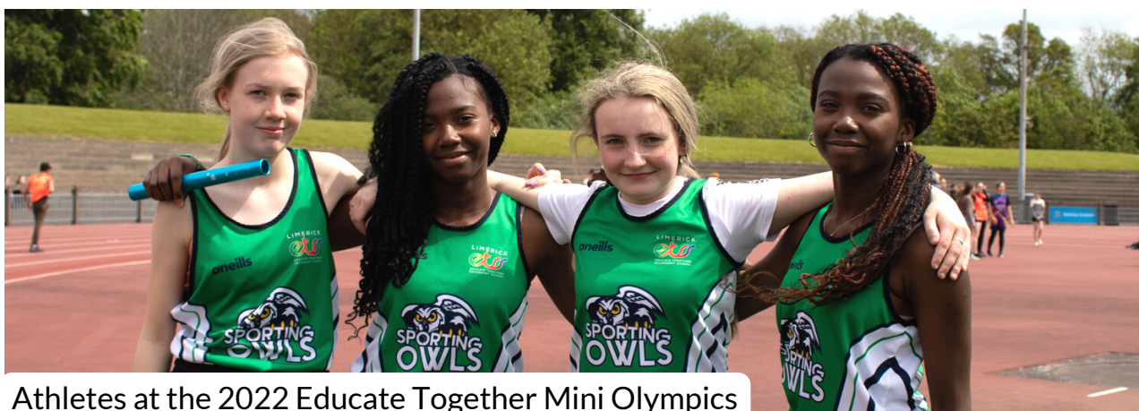
Athletes at the 2022 Educate Together Mini Olympics

Educate Together aims to be a leading voice for innovation and reform in education, continually striving for wider system change. This year we led on a campaign to secure better supports for children with additional needs, which saw additional posts ring-fenced for developing schools. A particular highlight of 2022 was the gathering of 167 second-level students in Clogher Road Community College for a national Student Event focused on Ethical Education and Global Citizenship. Connecting pioneering schools and students is so important, as we collectively develop a more student-centred and democratic education experience - there is so much we can learn from each other.