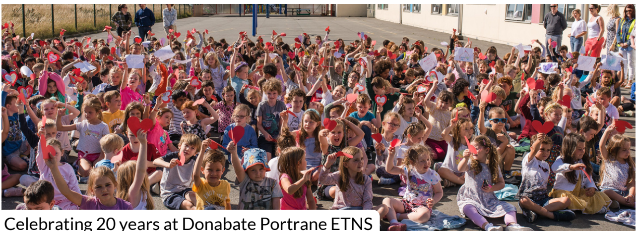
Celebrating 20 years at Donabate Portrane ETNS

In addition to these COPs that are supported by the national office, various groupings of primary and second-level Principals and Deputy Principals continued to engage and collaborate together on many areas, including leadership support and network events, such as second-level athletics, drama and debating competitions.