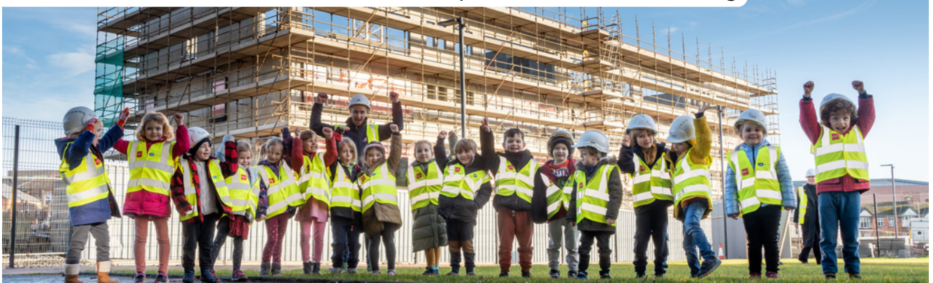
Dublin 7 ETNS Junior infant students survey their new school building

For detailed information on the organisation's finances in 2022, see our audited Financial Statements at: www.educatetogether.ie/about/reports