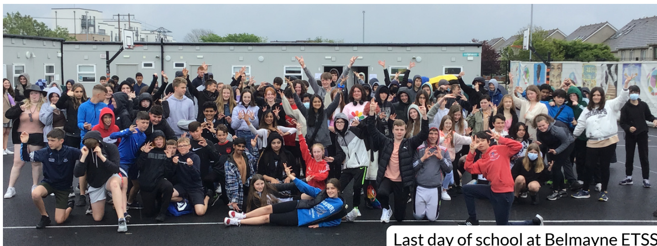
Last day of school at Belmayne ETSS

2022 saw Educate Together developing two new North-South collaborative projects. The first is an innovative partnership project to strengthen primary school provision in border communities, with the Integrated Education Fund (IEF) and Ulster University, funded by the International Fund for Ireland's Communities in Partnership Programme.