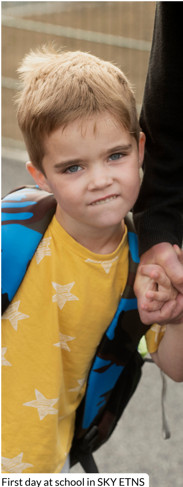
First day at school in SKY ETNS