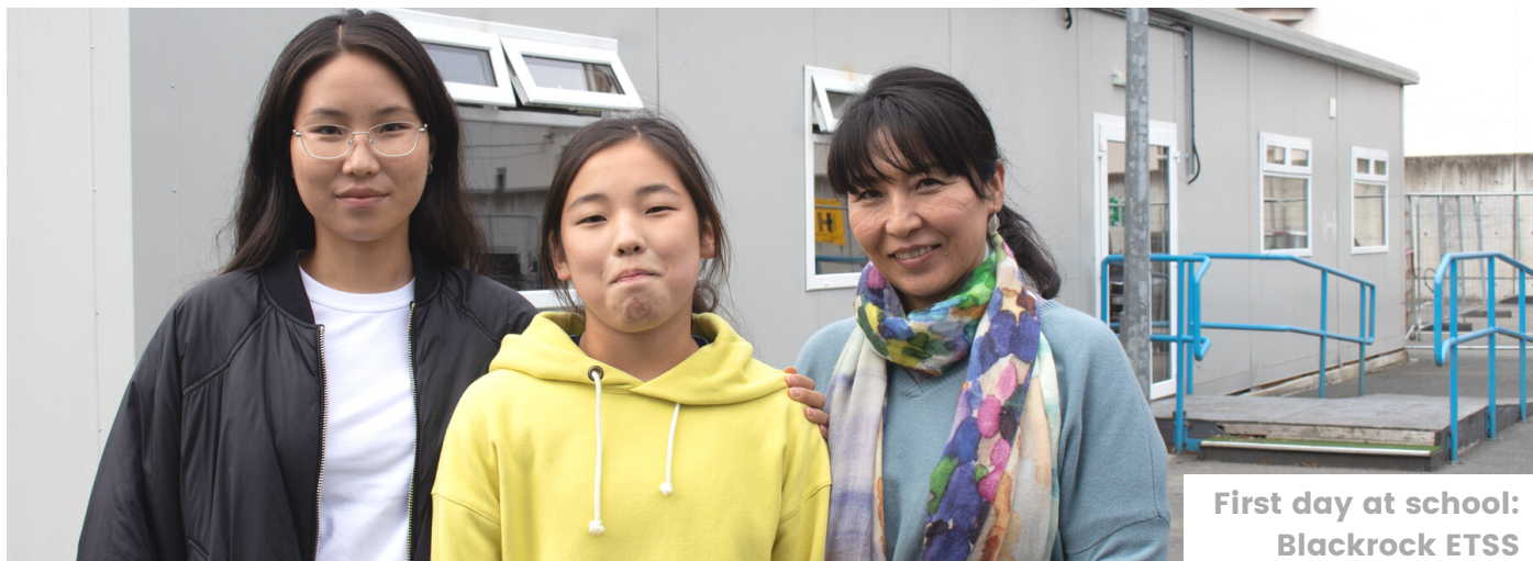
First day at school: Blackrock ETSS

Teacher Continuing Professional Development (CPD) 2021 proved to be a challenging year for the delivery of CPD due to impact of the pandemic on schools. Despite this, the changing nature of how we work presented opportunities to reach many teachers and staff members in Educate Together schools online and when possible, in-person; the following is a summary of the CPD provided by the national office over the course of the year: