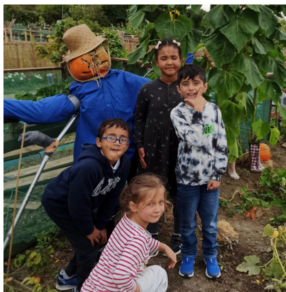
Outdoor learning at Stapolin ETNS