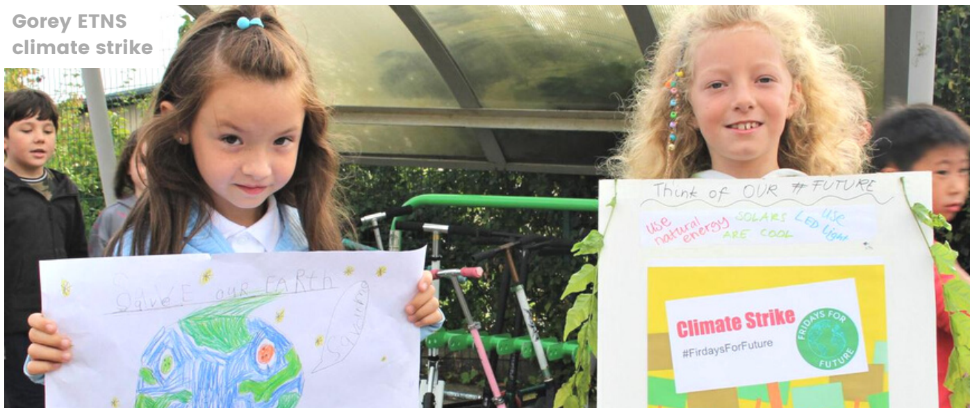
Gorey ETNS climate strike