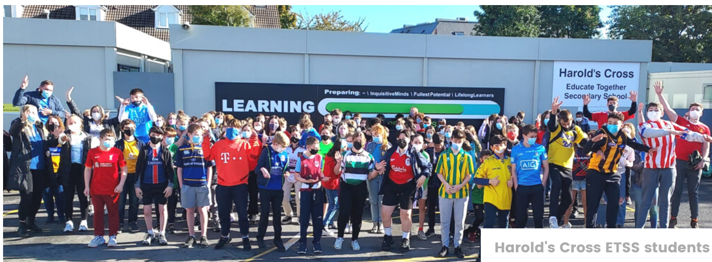
Harold's Cross ETSS students