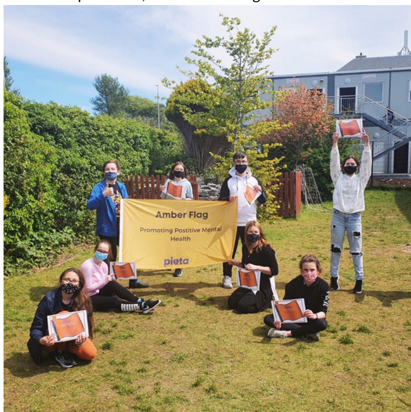
Galway ETSS amber flag promoting positive mental health

Educate Together is a registered charity. Our work is funded through a mixture of government and other grants, membership income, and fundraising.