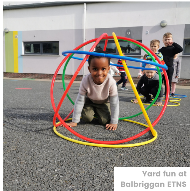
Yard fun at Balbriggan ETNS

Educate Together approved the appointment of eight principals and eight deputy principals in schools with its patronage in 2021. Appointments for 378 teachers and 60 additional needs assistants (SNAs) were approved.