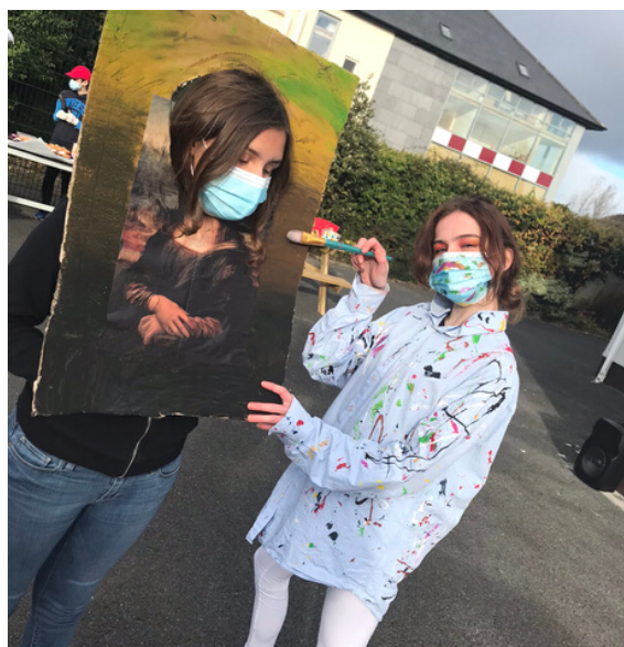
Modern art at Galway ETSS