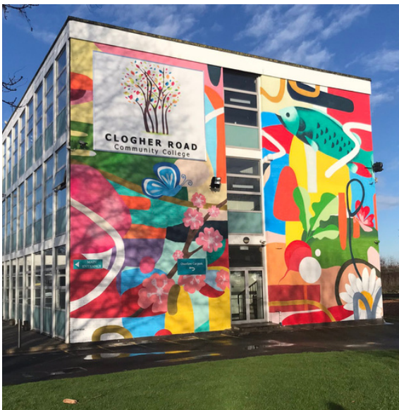
Clogher Road Community College mural

The Educate Together Senior Cycle Ethical Education curriculum was published in December 2021, accompanied by an online teachers guide. This was the culmination of three years' development work, supported by Salesforce and Worldwide Global Schools, and completes the continuum so that Ethical Education is now available from junior infants (age 4) to sixth year (age 18).