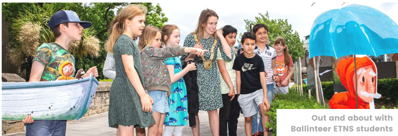
Out and about with Ballinteer ETNS students