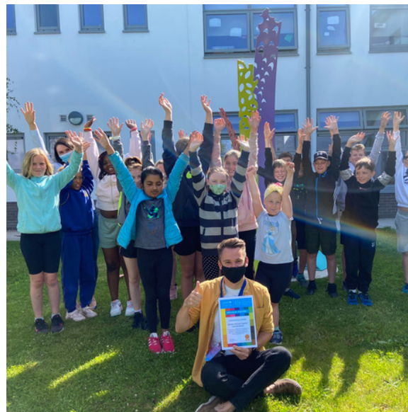
UN Rights Respective School - Midleton ETNS