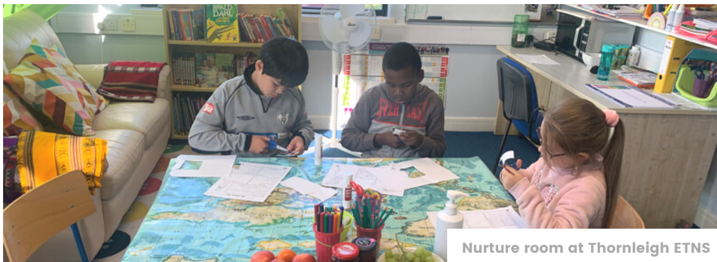
Nurture room at Thornleigh ETNS

Research and development are central to Educate Together's work as charity that is constantly striving to innovate in equality-based and democratic education, and a number of projects underway in 2021 involved research with external partners. Educate Together's Ethos Quality Framework, which was developed in collaboration with Dublin City University's Centre for Evaluation, Quality and Inspection, is the first such framework in Irish education and the process of development has become a model for other patron bodies. Curriculum development in 2021 included the Review of the Learn Together primary Ethical Education curriculum and the completion of the Senior Cycle Ethical Education curriculum (see above). A partnership was also formed in 2021 with Education and Training Boards Ireland to scope out the potential for the development of a new Certificate In Ethical, Multi-belief and Values Education with teacher education providers.