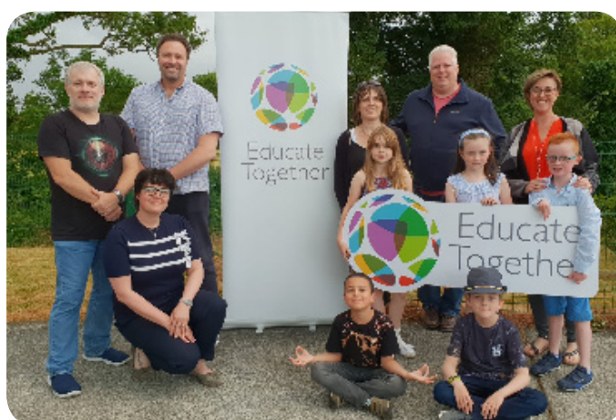
Supporters of Educate Together's Drogheda Laytown campaign

'I am delighted and very excited that we have finally reached the day where we will welcome all of our students through the doors of the newest school in South Drogheda/East Meath. As a native of this area it gives me great pride to have been given the opportunity to lead this school. Together with a team of seven teachers we have committed to providing the second .with a vibrant and innovative learning community which will be framed within a culture of positivity and mutual respect.'