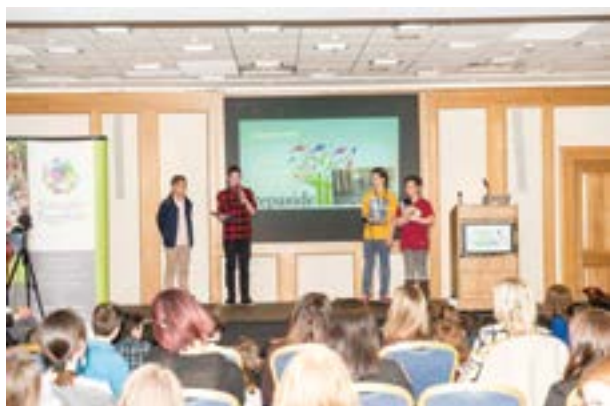
Students from Stepside ETSS

After this there was a StudentMeet which was when lots of primary school students joined us and some of us stood up on stage and talked about what initiatives we had carried out in our schools. There was also some competitions and spot prizes. It was a very good and interesting day for all of the Educate Together Student Councils.