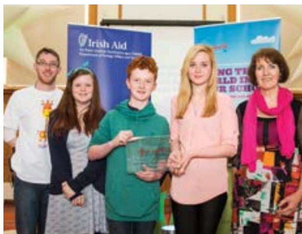
Pupils of Carlow Educate Together NS, representing their class at the 2015 Our World Irish Aid Awards Regional Finals

The deadline for receipt of entries is 24th March, 2017