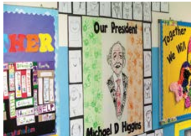
Tribute to President Michael D. Higgins at Donabate Portrane ETNS ahead of his visit

A General Meeting for Members is planned for the second term of the 2016/2017 school year to provide an opportunity for members to further discuss plans for financial sustainability.