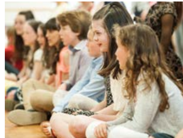
Students put on a fantastic performance to entertain the President and AGM delegates