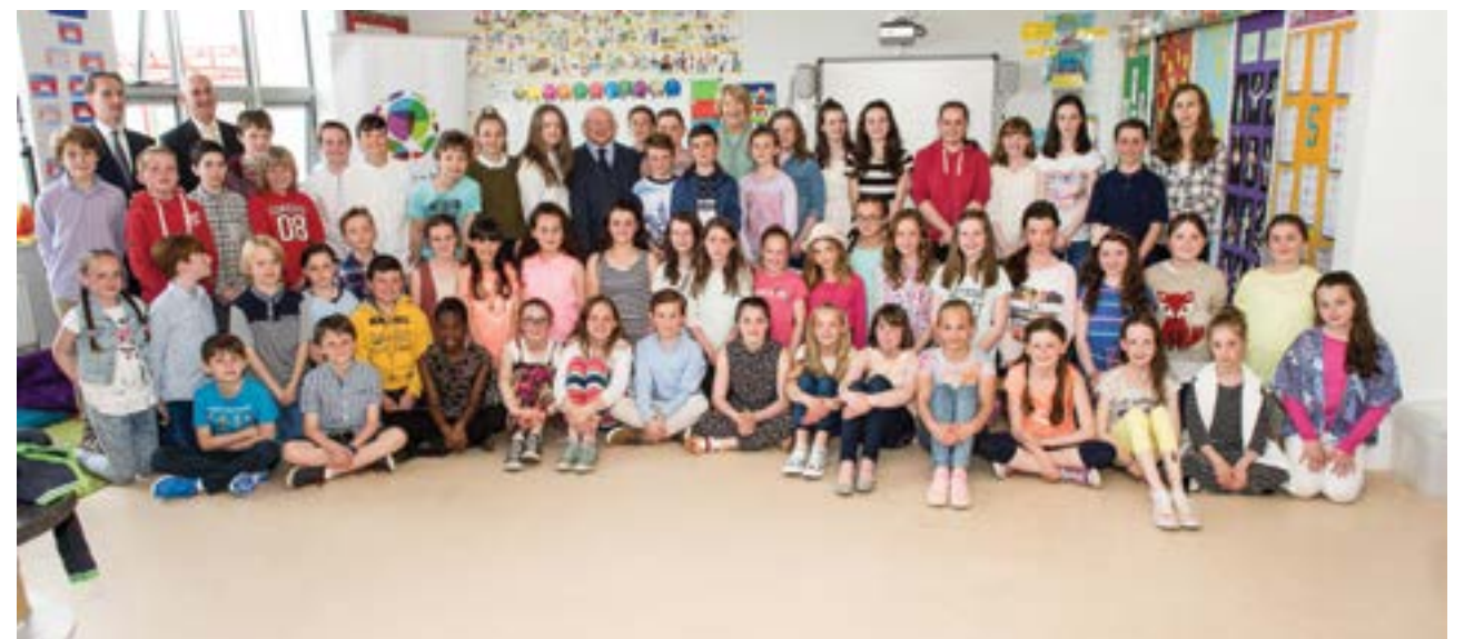
President Higgins and his wife Sabina with staff and students of Donabate Portrane ETNS