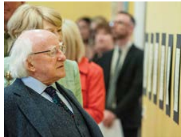
To celebrate 2016, Educate Together schools nationwide submitted their Proclamations that were displayed on the day of the AGM