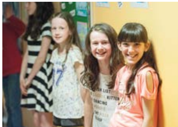
Excitement mounts as students of Donabate Portrane ETNS wait for President Higgins at this year's Educate Together AGM