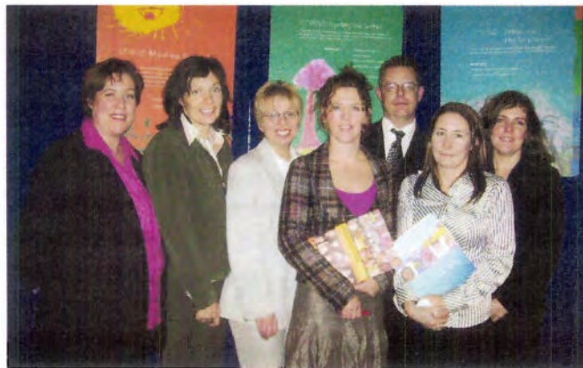
Waterford Second Level Public Meeting

A meeting was held in the Viking Ramada Hotel in Waterford on 6th November. The meeting was very well attended and a committee was formed to progress towards establishing a school.