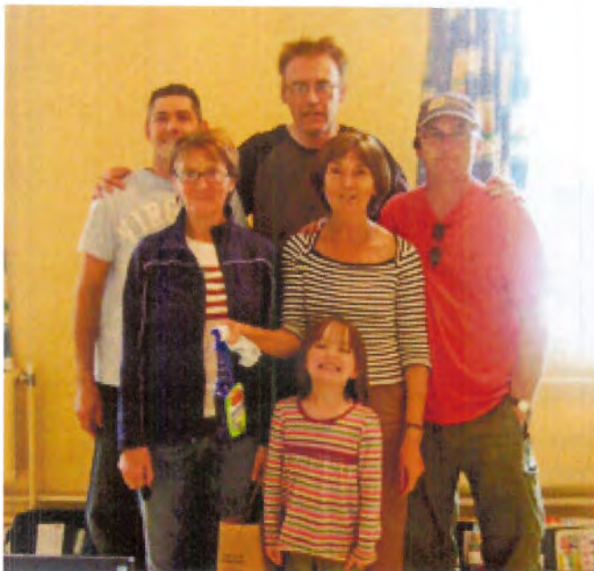
Part of the start-up team, the night before Bracken Educate Together National School opened