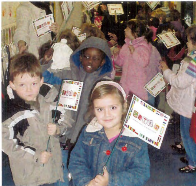
Children at Castleknock on their Official Opening Day 9th November 2007