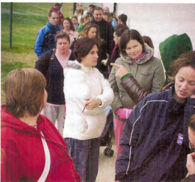
Parents lining up to pre-enrol their children for Greystones Educate Together National School on 3rd November 2007

Educate Together submitted formal notifications of its intention to apply to open schools in September 2008.