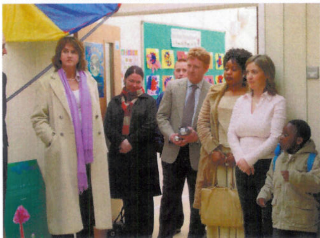
Joan Burton at the official opening of Tyrellstown Educate Together National School

Development Cooperation Ireland – a section of the Department of Foreign Affairs). This help has been invaluable in supporting our in-service programme for teachers and we are very appreciative to the Minister for Foreign Affairs and his staff in Irish Aid for this assistance.