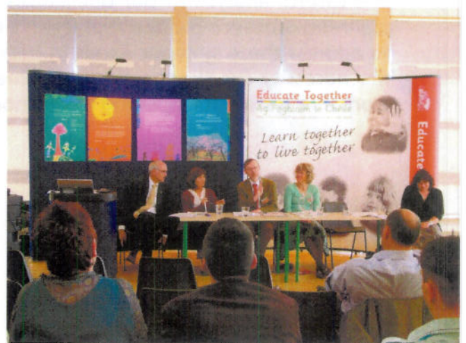
Presentation of the Business Plan at the October General Members Meeting

The plan contained a central judgement that Educate Together must consolidate and improve the services that it offers its existing schools and bring about a change in the system of opening new schools if it was to be able to expand to meet the scale of demand