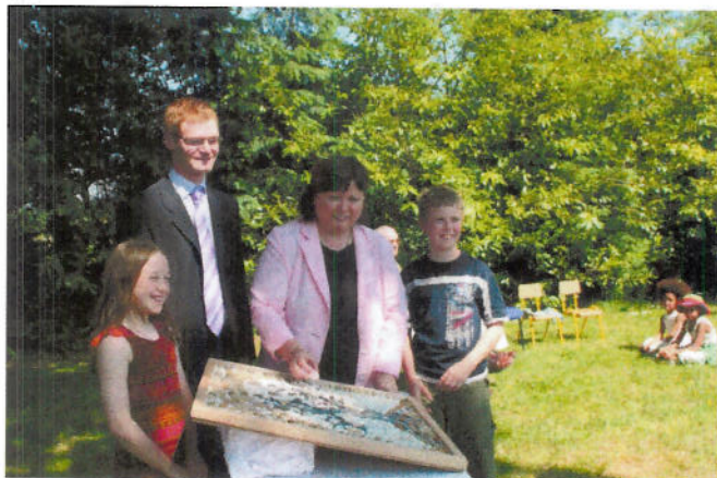
Mary Harney officially opening the Gorey Educate Together National School

community development and on recruitment took place. Our school support service reported increasing levels of difficulty encountered by boards in relation to funding, to employment issues and managing an increasingly difficult regulatory environment. The National Office continued to press the DES to provide funding for board of management training courses. In December, the DES finally decided to agree to this and sought records of all training carried out by the organisation since January 2003 with the view of grant aiding these programmes through the education centres.