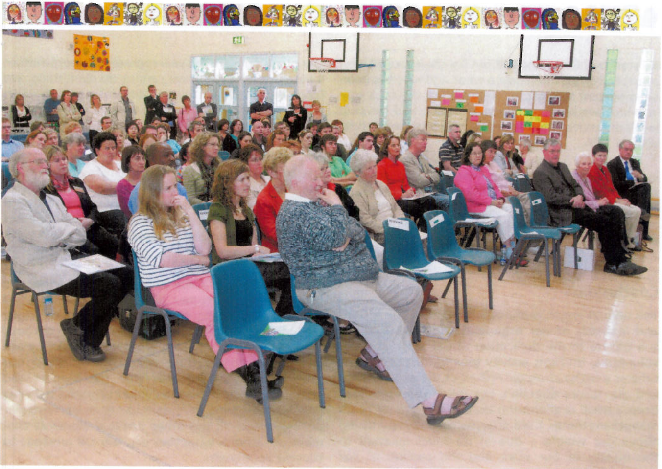
AGM 2006 at North Dublin National School Project