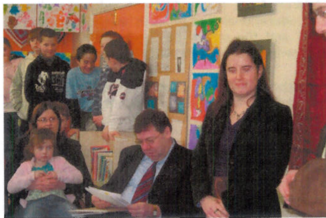
Brian Cowen officially opening the Tullamore Educate Together National School

pupils attending schools in the Educate Together network attended school in temporary buildings. Many of the most recent schools, in fact 80% of all new Educate Together national schools opened since 2000 are located in areas of rapid housing growth in which the need for a new school building has been known since the date of signature of planning permission for new housing estates. This situation is unacceptable and the fact that this has continued during a time of buoyant economic growth is a poor reflection on our economic priorities. A particularly worrying development in 2006 has been the effort by the DES to shoe-horn ever larger schools onto sites originally allocated to 16 classroom developments. In our opinion, it militates against good educational practice and will contribute to poor community environments for many years to come.