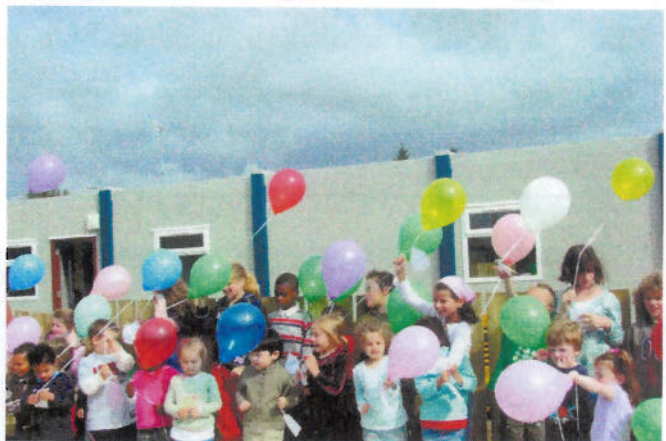
First day of Letterkenny Educate Together National School September 2006

It is disappointing to record that no Educate Together school moved into a new building in 2006. The only school with an active building project remained Castleknock ETNS. Despite the obvious needs in areas of rapid housing growth, the Department of Education and Science was unable to respond to the growing list of Educate Together schools in temporary accommodation. Longest on the waiting list is Gaelscoil an Ghoirt Aláinn which is still in a maze of prefabs. The school opened in 1993. By the end of the year more than half (4,020) of the 7,400