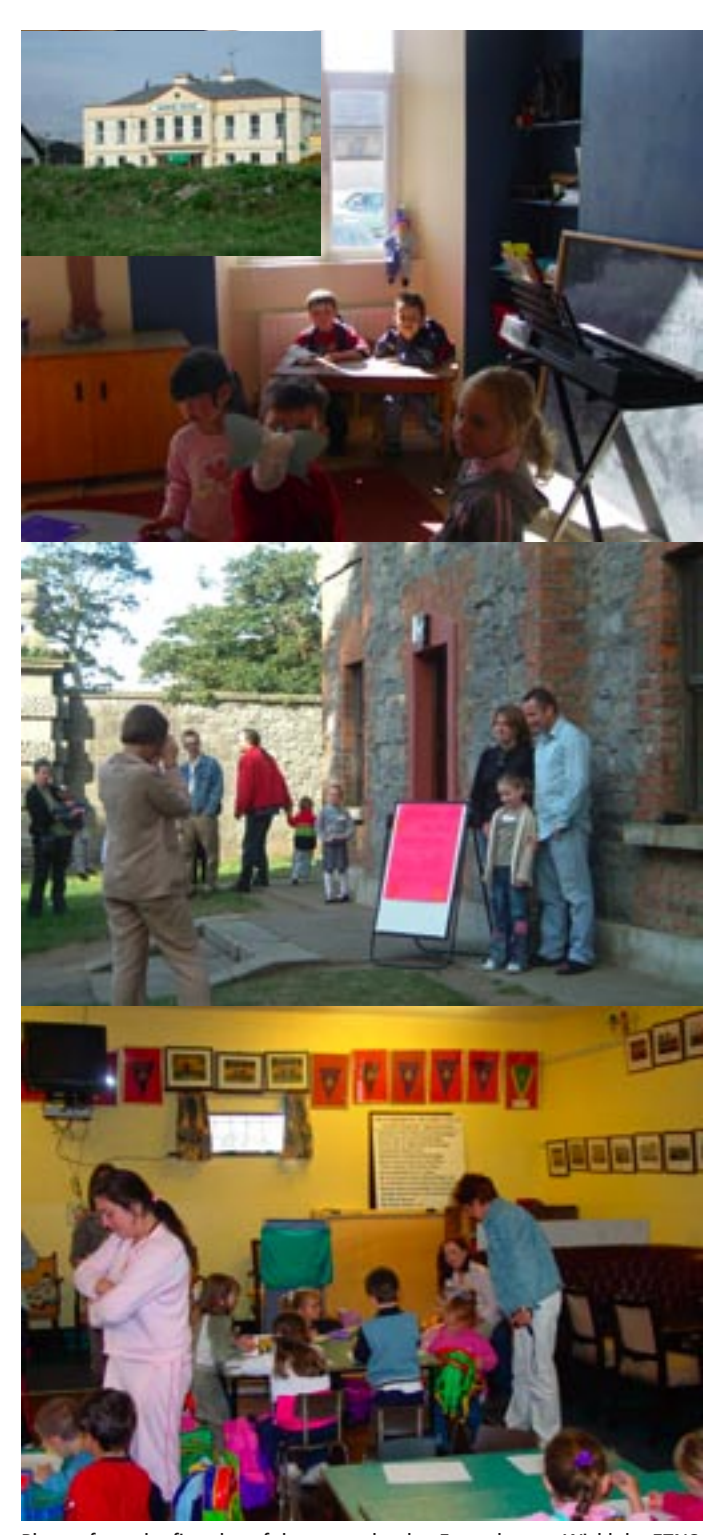
Photos from the first day of the new schools - From the top. Wicklolw ETNS, Rush Lusk ETNS and South Kildare ETNS

Despite the great difficulties caused by the restrictions on the Capital Building Programme in 2003, Educate Together schools have considerable progress with their building plans. Of particular note are the achievements of North Kildare Educate Together School and Lucan Educate Together National School who moved into their purpose-built buildings. Both schools are Stateowned.