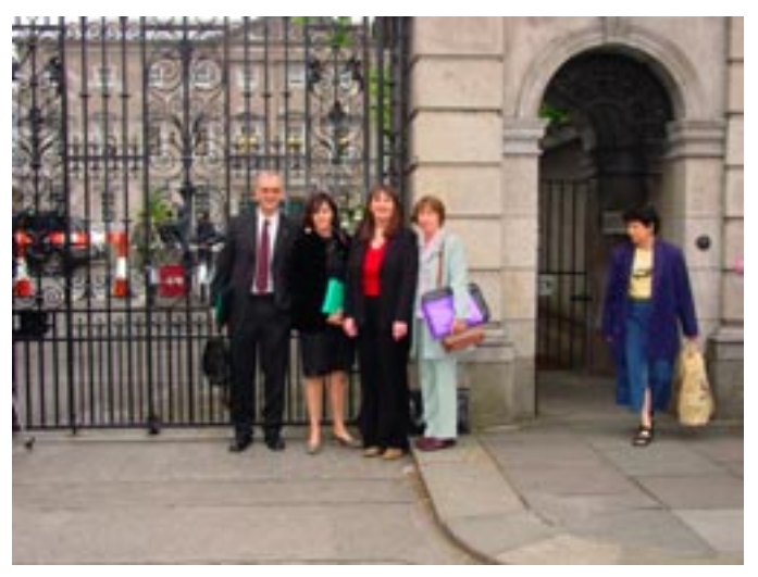
formally expressed at the Oireachtas Joint Committee. We will be continuing this work on an ongoing basis into the future.

In order to achieve our objective that any family in the State should have a realistic option to send their children to a multi-denominational school, we need a strategic policy decision to be taken by the government to support the development of the Educate Together sector or schools that offer the same guarantees of inclusion and educational rights as our schools provide. Such a decision is the only way in which the State can vindicate its obligations under Article 42 of the Constitution, the European Convention of Human Rights, the United Nations Convention on the Rights of the Child and the UN Convention for the Complete Elimination of all forms of Racial Discrimination. In order to prepare the grounds for this decision, Educate Together has presented this case to the Oireachtas Joint Committee on Education and Science on July 3 2003 and has commenced work with a number of governmental and non-governmental agencies. These have included the Equality Authority, Irish Council of Civil Liberties, Amnesty International, Irish Human Rights Commission and the Children's Rights Alliance. We were particularly encouraged by the all-party support for our work