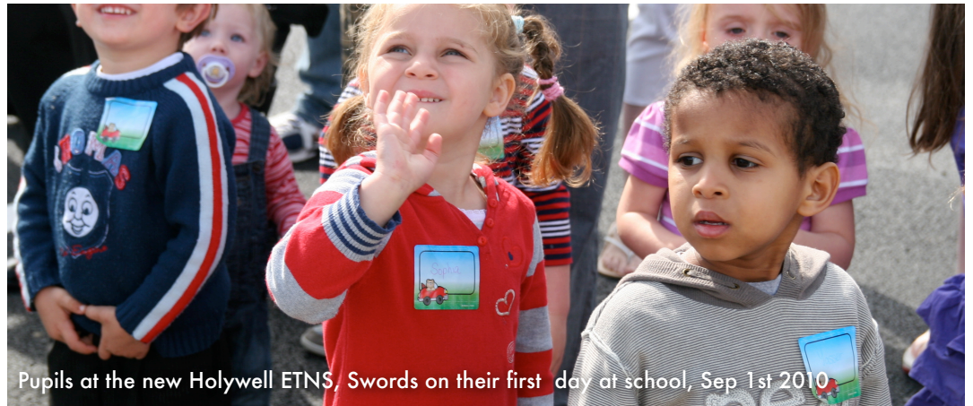
Pupils at the new Holywell ETNS, Swords on their first day at school, Sep 1st 2010